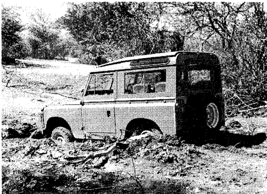
Land Rover in mud!

His great interest, naturally, is education. "We took this Mission over from some German Fathers after the First World War. Since then we have built it up to be the finest Mission-school in the area. We're proud of our graduates, and our reputation is such that we have the pick of the bunch. Students pay what they can and Government subsidizes each one. Our greatest problem is with girl students. Often, after only a few years of education, the families want them to return home to help their mothers in the fields or else get married. This puts the child in a dilemma since she rarely wants to return, and yet family discipline is strong. Those who decide to stay know they can never return home. Needless to say few remain in school under those circumstances. Our next greatest problem is to get qualified teachers. Do you know any Americans who would like to come out here for a couple of years?" We assured him we would look into it.