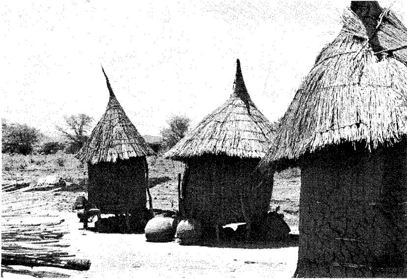
Grain is stored in these small granaries.

the original tribe to which they belonged.