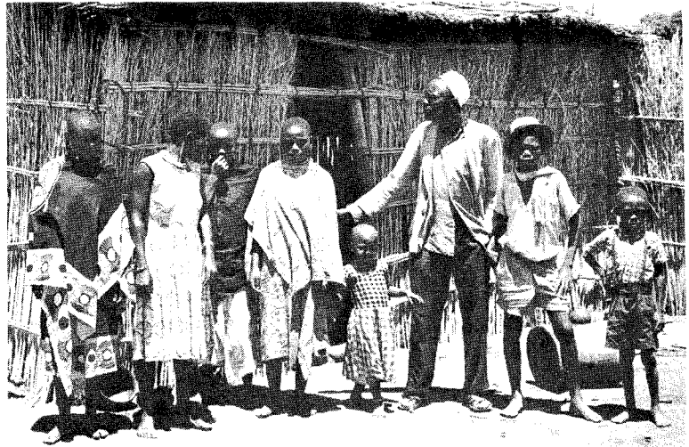
A local headman and some of his wives and children.