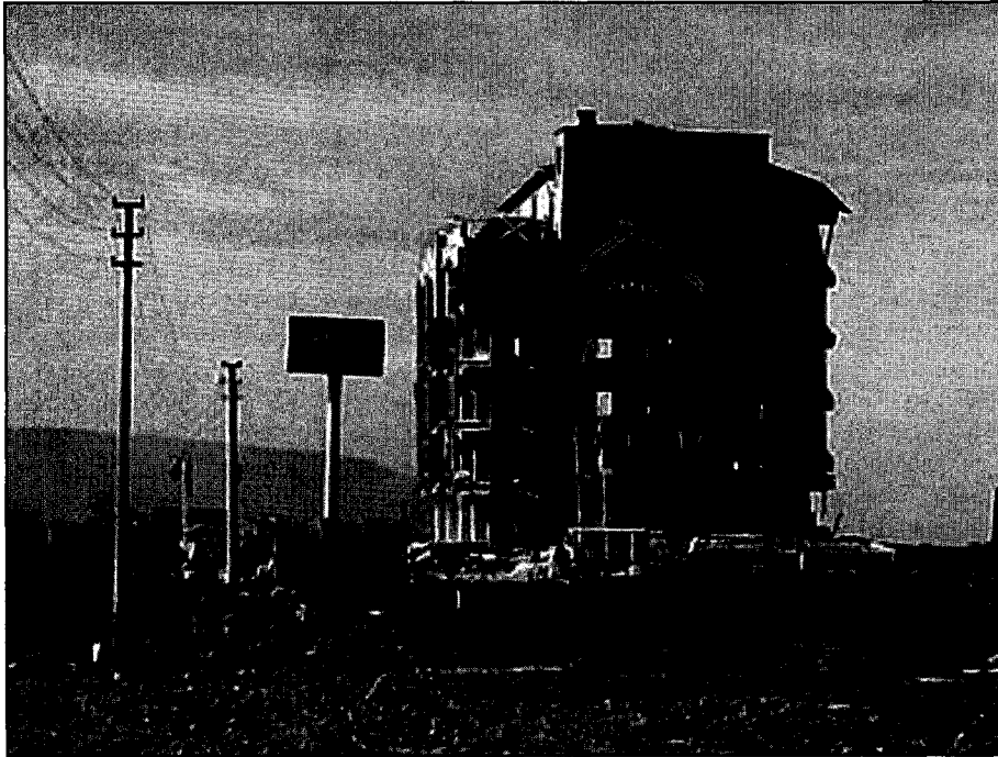
A strangely crumpled office building near Golcuk

soldiers were in the area, he said, helping with security, communications and distributing emergency supplies. But much of this effort was invisible to civilians around the base who shouted through the fence, first begging for help then cursing the military for not delivering it.