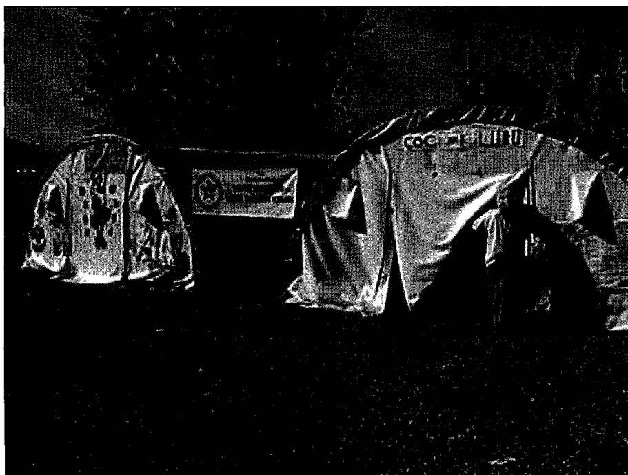
A makeshift preschool in the camp

I asked the women how they'd survived the quake. A teenage girl said she'd run out of her building just in time to see the one across the street implode before her eyes. A young mother said she and her family had no chance to escape and a wardrobe had fallen on her little daughter. But " Allah korudu " ("Allah protected us"), she said: the building was seriously damaged but didn't collapse. Sixteen of her relatives in the area hadn't been so lucky. A man walking with the aid of a cane said he'd been one of 11 people who survived because they'd been on the top floor of their five-story building when it fell; more than 50 others on lower floors died. Like the vast majority of people who walked or were pulled alive from