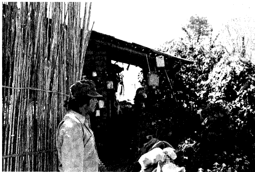
Pedro Dominguez stands by his family corn silo.

"I believe that a ton of corn is now selling at 15,000 pesos. This is a bit more than a ton; it's probably worth about 20,000 pesos. But in difficult times like these, we usually sell some of our animals."