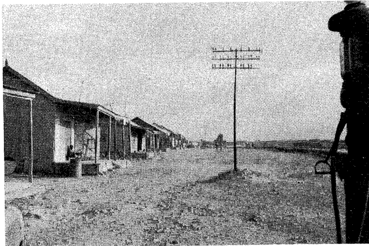
Isiolo, looking south from the gas station

Leaving the gas station, we started north and were halted by a red and white striped road barrier at the end of town. We had to cross a spur of the Northern Province to reach Samburu and the Northern Province is closed to the general public. It is so vast that stranded tourists would be likely to die of thirst before being found. Tribal warfare erupts frequently and, although Europeans seldom if ever are attacked, the authorities feel it is better that they stay out of the way. A European police officer in the Northern Province cited these reasons when I asked him why the province is closed, and added: "And we don't want Europeans coming in here and upsetting the people and slaughtering the game. We want to keep it just like it is."