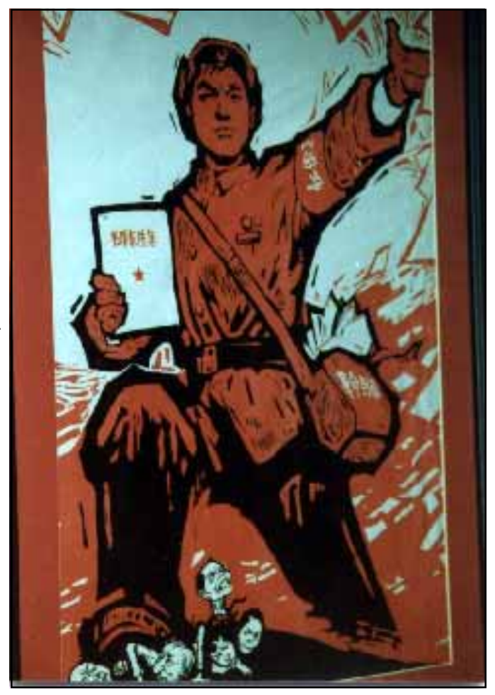
Americans have either loved the China created in their own image, or feared and hated the China that refuses to fit into the American image. This picture portrays a Red Guard in the 1960s, trampling his enemies.

Many Americans had overlaid their own democratic ideals on the student movement. And though their longings seemed admirable, many of the student leaders, when asked what they wanted in the movement, were not sure. One student said, "I don't know exactly what we want, but we want more of it." When the People's Liberation Army (PLA) turned on those students, and anyone else