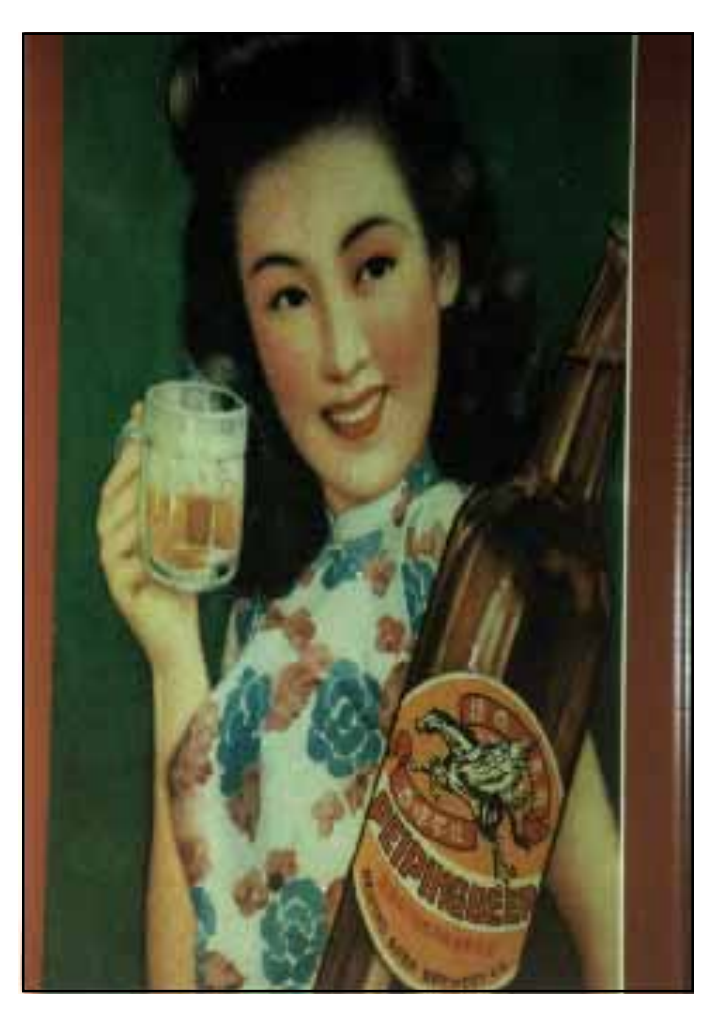
This Chinese beer commercial from early this century portrays a Chinese woman — like Song Meilin — who looks "a lot like us." The result of a China created in our own image has been a trail of fractured illusions.

China?" debate and McCarthyist paranoia of the 1950s.