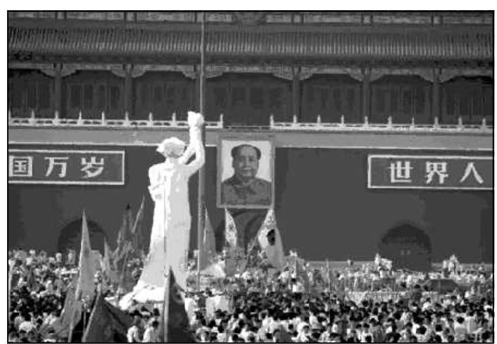
"Lady Democracy" confronts Mao on Tiananmen Square; June. 1989.

process of modernization. Social stresses produced by frenetic change, political tensions over how fast to reform, peculiarities of an economic system that exists in a neither-nor state between socialist-style planning and a full-blown market economy, and a moral and spiritual vacuum among a people who are unsure of what to believe have resulted in a three-steps forward, two-steps back advancement to find their own identity.