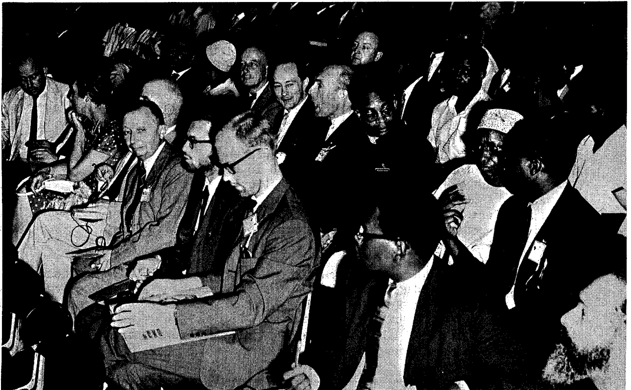
FACES IN THE CONGRESS