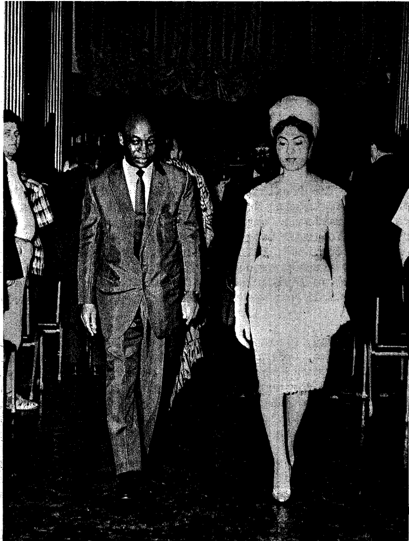
PRESIDENT NKURUMAH AND HIS WIFE

Enjoining the Congress that it was incumbent