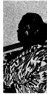
NANA KOBINA NKETSIA IV

Like some great century plant that shall bloom In ages hence, we watch thee; in our dream See in thy Swamps the Prospero of our stream; Thy doors unlocked, where knowledge in her tomb Hath lain innumerable years in gloom. Then shalt thou, waking with that morning gleam, Shine as thy sister lands with equal beam.