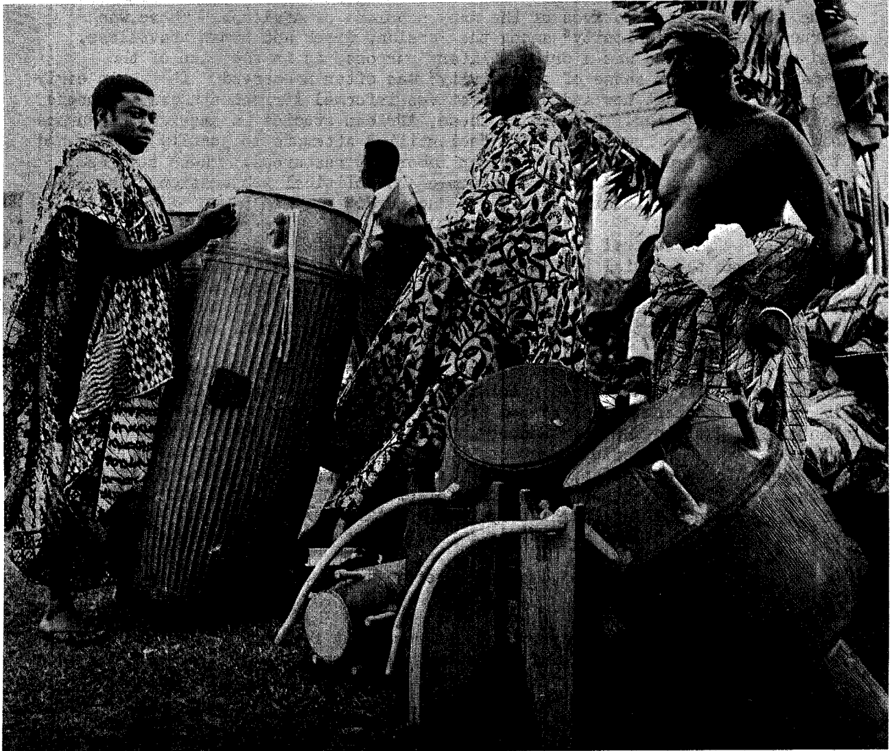
THE DRUMS AND DRUMMERS OF OSAGYEFO

President Nkruman had not come "to say a few words." He came with a full scale address that was bedecked with historical references and adorned