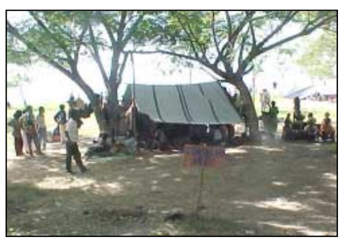
The CPD-RDTL faction from Aileu, a town in central East Timor.