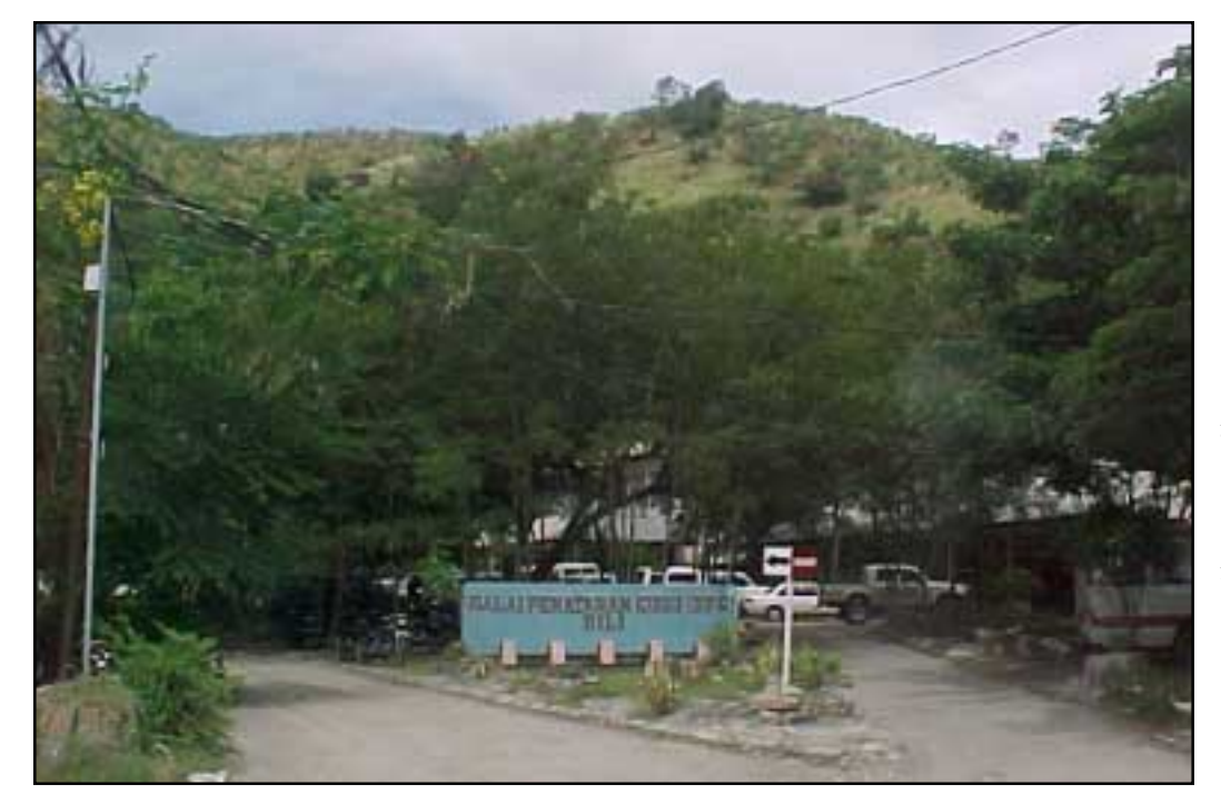
The CNRT's office complex, nestled in the foot hills of south Dili, was previously the primary-level teachertraining center under Indonesia. The UN used the complex as its base for the referendum of 1999, and the compound was made famous by the militia siege following the vote when over 2000 people sought refuge within its walls.

1977 for trying to negotiate with the Indonesians and, suspiciously, spent the occupation living well in Jakarta. CPD-RDTL members have held dozens of protests and rallies around the UNTAET headquarters demanding recognition and positions of power, and denying accusations of Indonesian support.