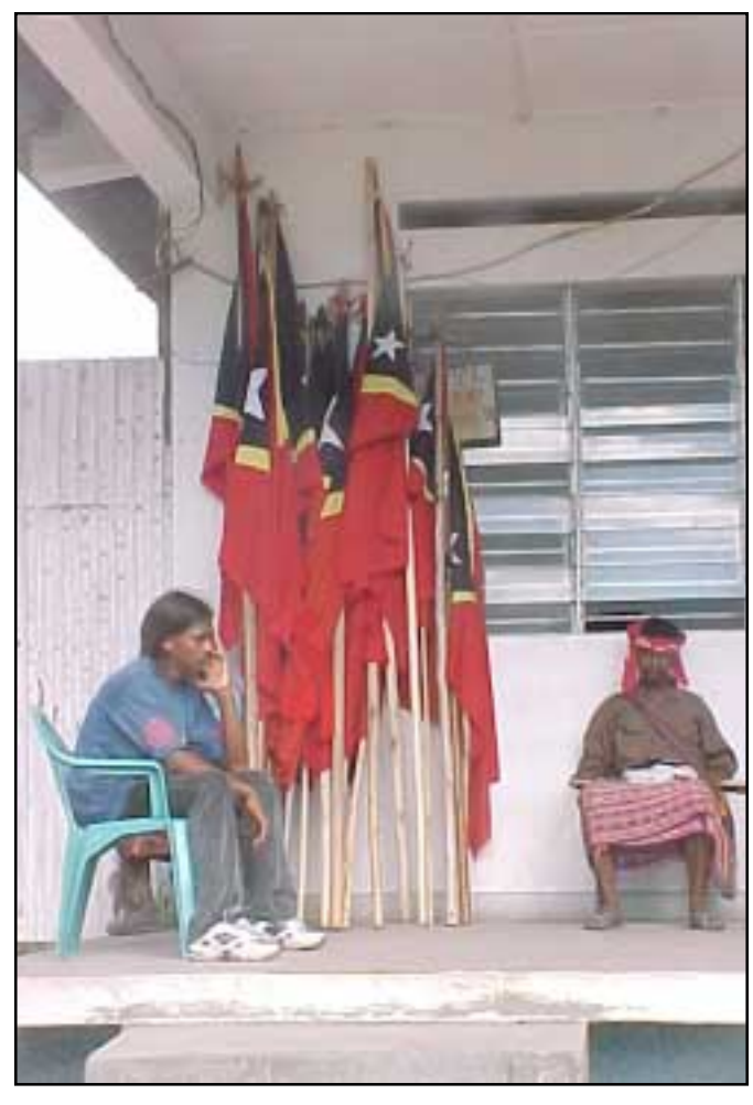
A stack of flags used during the rally. This flag is the original flag of the ASDT, predecessor party to Fretilin. Fretilin continues to use the flag, although several splinter parties including CPD-RDTL are trying to commandeer the flag as their official symbol because it is well known to the local population.