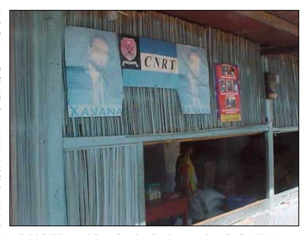
Faded CNRT posters left over from the referendum paper the walls of local businesses

Gusmao was captured by the Indonesians in 1992. By that time he had become a national hero and a political figure with some recognition worldwide. He had developed communication with the resistance movement outside of East Timor, honed skills of international diplomacy, tapped resources of solidarity from around the