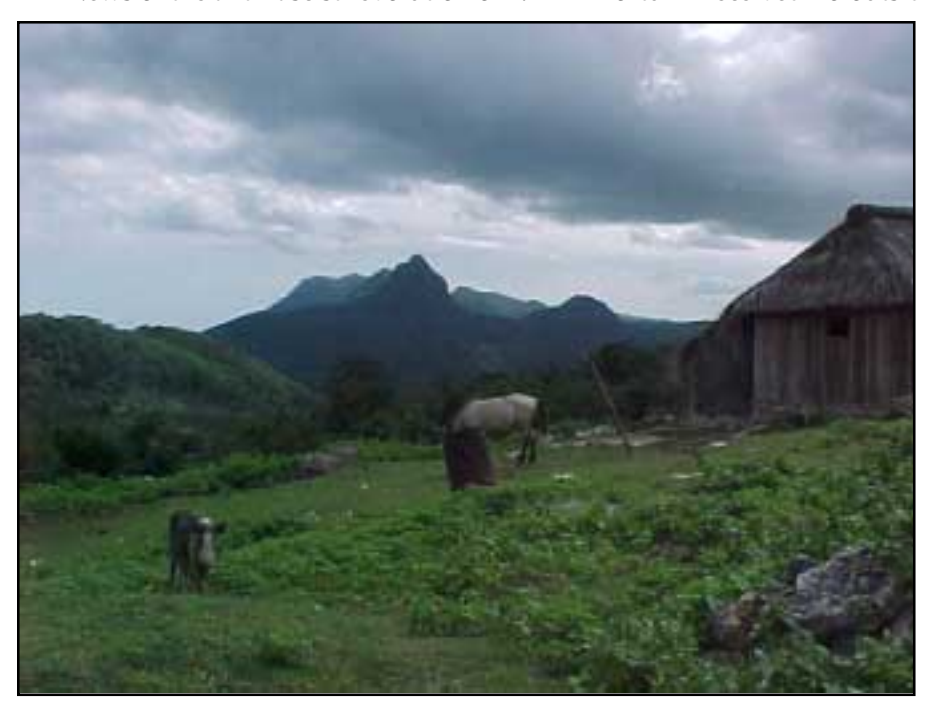
Rugged mountains near Matebian, eastern East Timor

As part of its Campaign of Annihilation, begun in September 1977, Indonesia made extensive use of aerial bombing and napalm drops to destroy the Timorese resistance. Falintil forces in the eastern region that Gusmao was leading were eventually forced to retreat, together with a large segment of the population, to a mountain called Matebian (meaning "departed soul") in east-central East Timor. Indonesian forces surrounded the mountain and killed