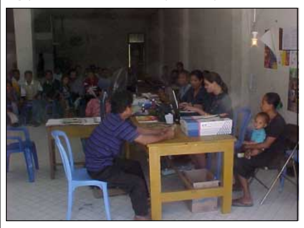
A registration center in central Dili

Today things are a bit more relaxed, and the UN has set the target end date as June 20, giving a total of just over three months for the population to come forth. Propaganda in the form of information, slogans and songs fills the airwaves on