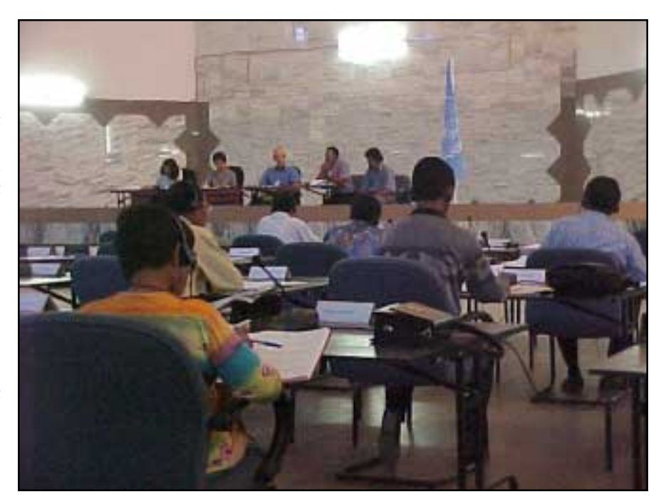
UNTAET 'S Human Rights Division gives a presentation to the NC.

I walk past the vast chamber of the NC every time I visit the education section of UNTAET. Sometimes I step in and enjoy the powerful air conditioners that chill the space. It is always interesting to see if I can figure out what is happening. All speaking is done into microphones, which are linked to simultaneous-translator booths, one for each of the four relevant languages. The translated speech is then transmitted to the NC members, public and media, who are wearing multi-channel receivers with headphones enabling them to listen in the